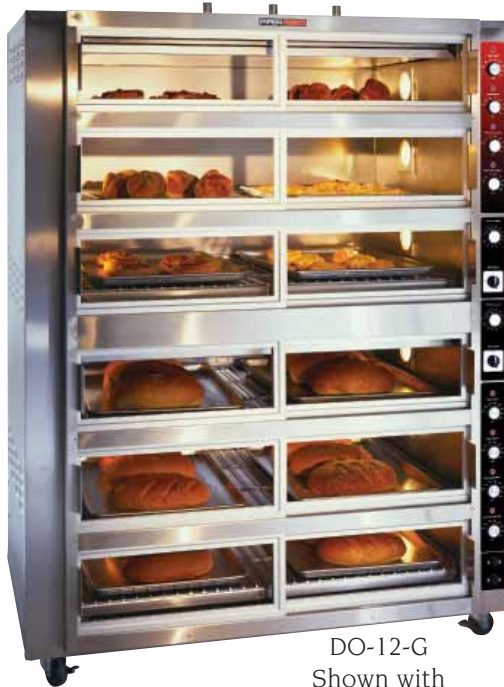
DO-12-G Shown with Glide-By Doors

When high-volume production is a reality and quality baked product is desired, trust the DO-12 from Super Systems. Each individually controlled deck gives our trademark hearth bake, while full-view glass doors provide an effective merchandising tool. Together, these features will help you sell as much product as you can make!