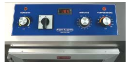
Control Panel View