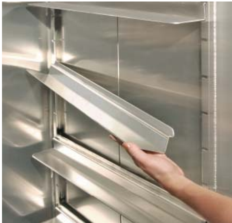
Universal glide easily adjustable