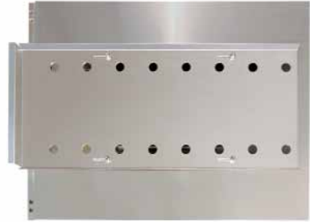
Adjustable vent on top of unit vents heat and moisture

The Piper ER-18 Enclosed Rack is designed to provide an attractive storage cabinet.