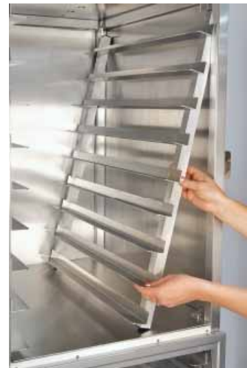
Interior racks are easily removed for cleaning and maintenance