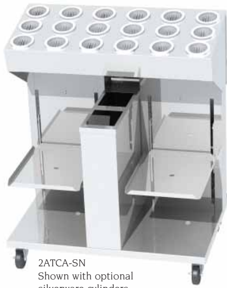
2ATCA-SN Shown with optional silverware cylinders