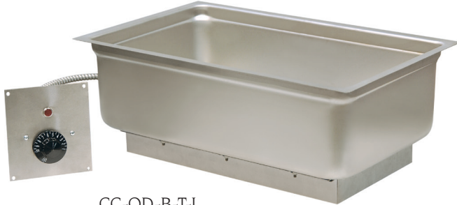
CC-OD-B-T-L B - Bottom-insulated w/o drain, coved corner.

Piper's Bottom-mount Built-in Hot Food Wells are designed to maintain the serving temperature of prepared food during the serving period. Hot food wells may be used wet or dry.