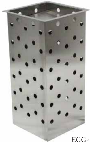
EGG-1212 Drop-in type