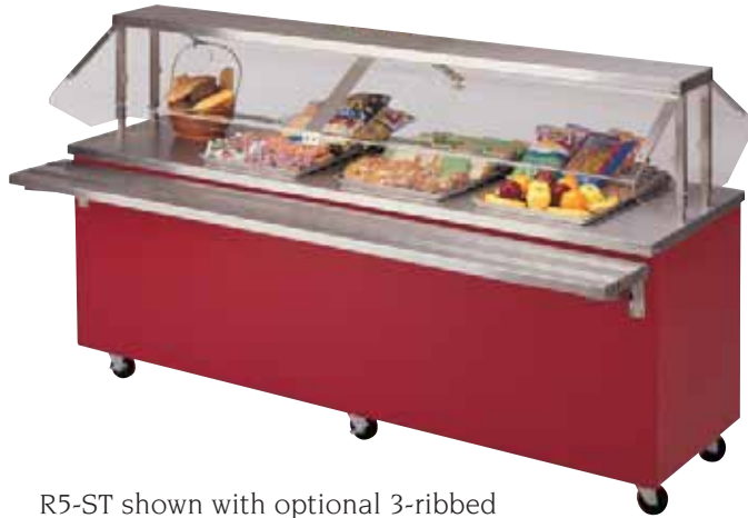
R5-ST shown with optional 3-ribbed tray slide and BPG protector guard

The Reflections Solid Top units are ideal for use as worktops, for plating and for sandwich and salad preparation. This unit can also be used as a counter for other serving and merchandising needs.