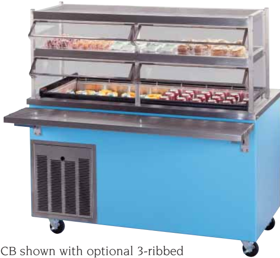
R4-CB shown with optional 3-ribbed tray slide and 2-tier display stand

The Cool Breeze unit is ideal for the front-of-the house for salad bars and kiosks and is the perfect product for cook-chill tray lines where cold food temperature maintenance is a must.