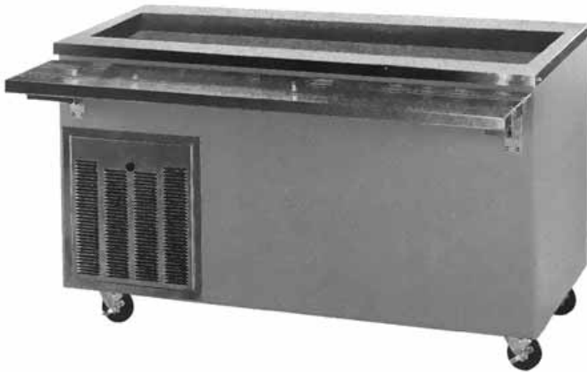
R5-CM shown with optional 3-ribbed tray slide

The Piper Cold Food Units are available mechanically cooled (R-CM) or ice only (R-CI). These units are designed to serve a variety of refrigerated food products and are ideal as a salad bar merchandiser. The versatile modular design allows you either a cafeteria or a buffet unit to fit your line-up. Reflections units are compatible and will interlock with other Reflections units.