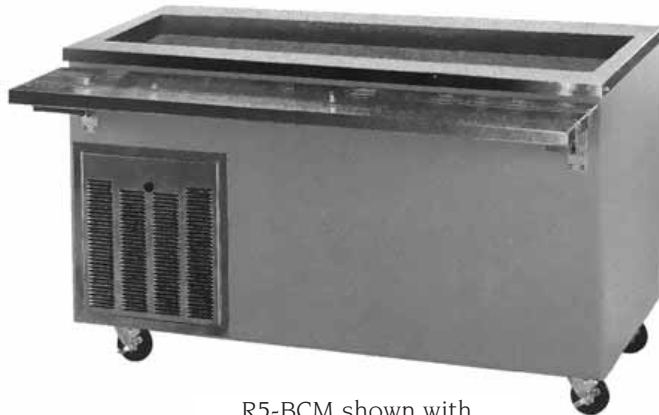
R5-BCM shown with optional 3-ribbed tray slide

The Piper Bloomington Cold Food Unit features an extra deep cold pan of 9-7/16" deep and is listed NSF/ANSI Standard 7. The Bloomington Cold Units are designed to serve a variety of refrigerated food products, these units are ideal as a salad bar merchandiser. Reflections units are compatible and will interlock with other Reflections units.