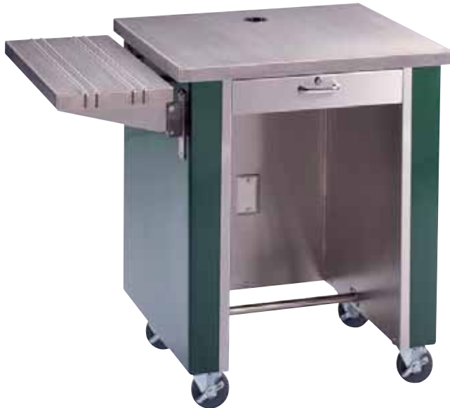
R1-CS shown with optional solid ribbed tray slide

The Reflections Cashier Stand is a comfortable workstation. Ideal for use in cafeteria/buffet lines, school line ups and hospital cafeterias. This Reflections unit is compatible and will interlock with other Reflection units or the Cashier Stand can be operated as a freestanding separate unit.