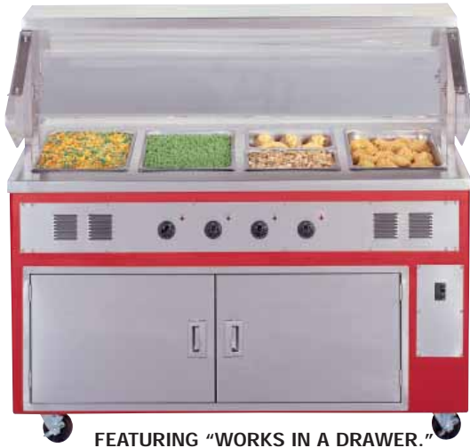
FEATURING "WORKS IN A DRAWER." QUICKLY REPLACE & REPAIR HEATING ELEMENTS.

R4-HF Operator's side shown with optional RBPG protector guard and open under storage with hinged doors