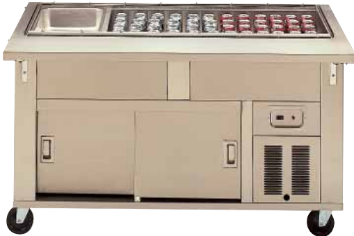
4-CB shown with optional cutting board

The innovative "Cool Breeze" technology allows you to maintain product at 41 degrees Fahrenheit or less yet requires no ice. The unit cascades a "Cool Breeze" of air over the product without drying it out or causing freezer burn.