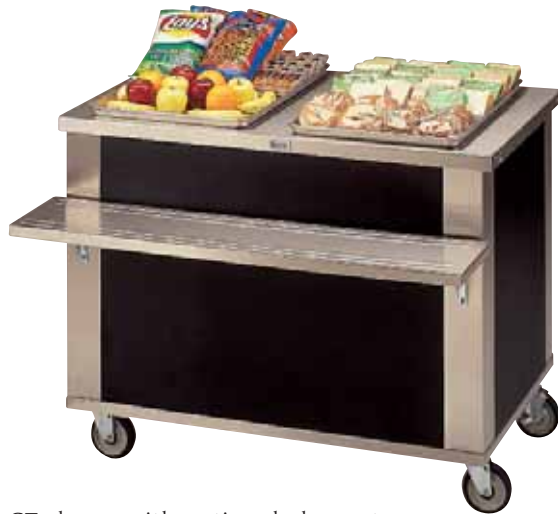
3-ST shown with optional elementary height solid tray slide and formica finish

The Elite 500 Solid Top's versatile modular design allows you to custom design either a cafeteria or a buffet line-up. Elite 500 units are compatible and will interlock with other Elite 500 units. This allows the units to be disconnected for cleaning under the serving line. With Elite 500 you choose only the options and accessories that you want and need.