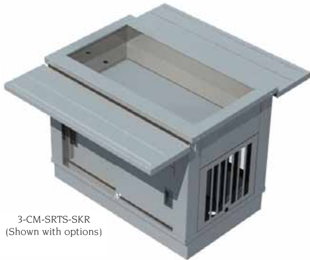
3-CM-SRTS-SKR (Shown with options)

The Elite 500 Cold unit is available mechanically cooled (CM) or ice only (CI). The versatile modular design allows you to customize your cafeteria or buffet line-up, choosing only the options and accessories that you want and need. Elite 500 units are compatible and will interlock with other Elite 500 units. This allows the units to be disconnected for ease in cleaning.