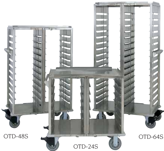
Shown with optional corner bumper.

Piper's Open Tray Delivery Carts are designed as the most efficient way to dispense and transport large numbers of meal trays. Excellent for meal tray delivery and soiled tray retrieval. Available in a wide variety of sizes and capacities, our carts are the perfect solution to your meal tray delivery system. By offering models to fit any tray system, Piper's carts are the most flexible units in the food service and institutional markets.