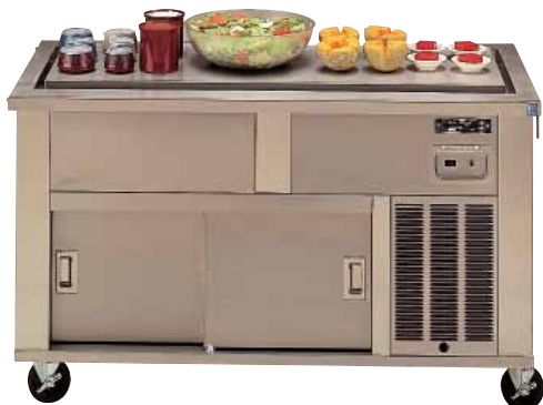
3-FT shown with sliding doors

The Elite 500 Frost Top Units are perfect for dessert or salad merchandising such as parfaits, pastry, jello and a variety of salads. Elite 500 units are compatible and will interlock with other Elite units. This allows the units to be disconnected for cleaning under the serving line. The modular design of Elite 500 allows you to design either a cafeteria or buffet line-up and choose only the options and accessories that you want and need.