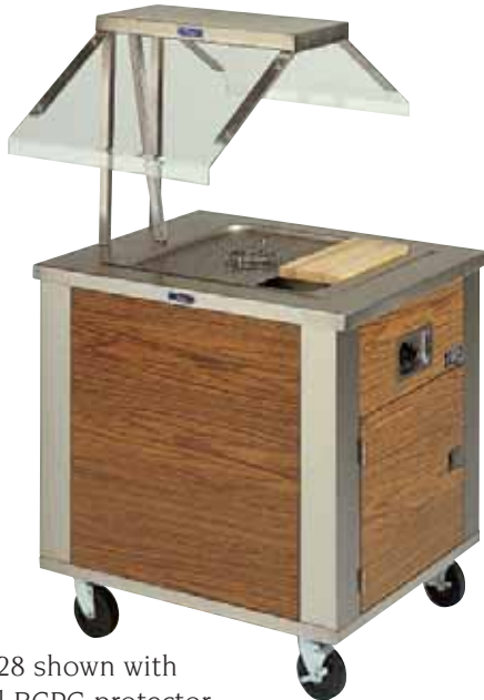
BAC-28 shown with optional BCPG protector guard and formica finish

The Elite 500 Beef Ala Cart is the ultimate touch of class. Chefs can display their carving talents to the customer's delight. All Elite 500 units are compatible and will interlock with all other Elite 500 units.